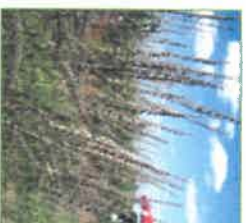
Sideoats Gramma Bouteloua curtipendula 21 Insect species