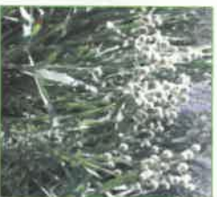
Summer Rattlesnake Master Eryngium yuccifolium 185 Insect species