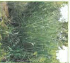
Indian Grass Sorghastrum nutans 19 Insect species