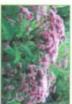
Baby Joe Dwarf Joe-Pye Weed Eutrochium dubium 'Baby Joe' 66 Insect species