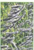
Blue Fortune Hyssop Agastache 'Blue Fortune' 48 Insect species