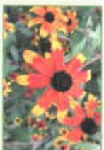
Prairie Glow Brown-Eyed Susan Rudbeckia hirta 'Prairie Glow' 202 Insect species