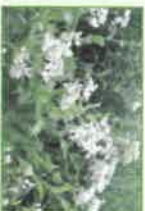
Wild Quinine Parthenium integrifolium 56 Insect species