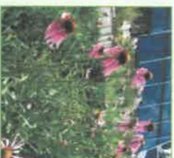
Summer Pale Purple Coneflower Echinacea pallida 57 Insect species