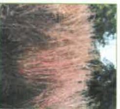
Little Bluestem Schizachyrium scoparium 40 Insect species