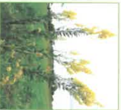
Fall Snowy Goldenrod Solidago speciosa 50 Insect species