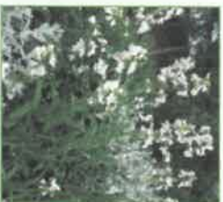
Spring Smooth Penstemon Penstemon digitalis 44 Insect species

When choosing plants for a holistic design, select the plant that meets your growing requirements and provides benefit to the most insect species throughout the seasons.