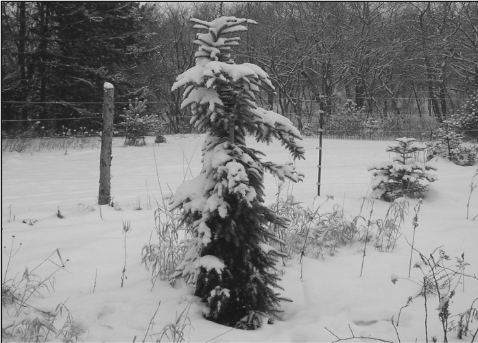
Picea omorika 'Pendula Bruns'