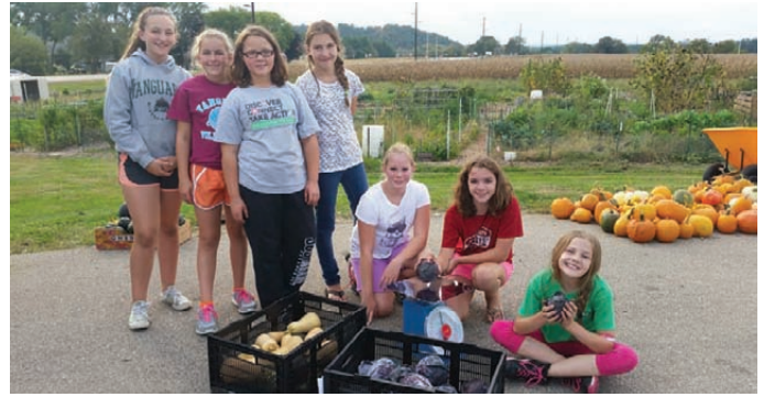
The Girl Scouts after their last food pantry harvest at the garden.

Our goal is to put a sand point well in (a well consisting of a pipe with a solid steel point and lateral perforations near the end, which is driven into the earth until groundwater is reached). We started purchasing some of the supplies by holding a Brat Fry at the Shoe Box. The remaining cash outlay will be approximately $1000. We are searching for grants, but since we