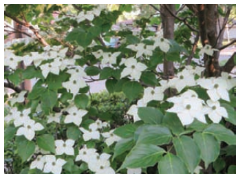
Kousa dogwood